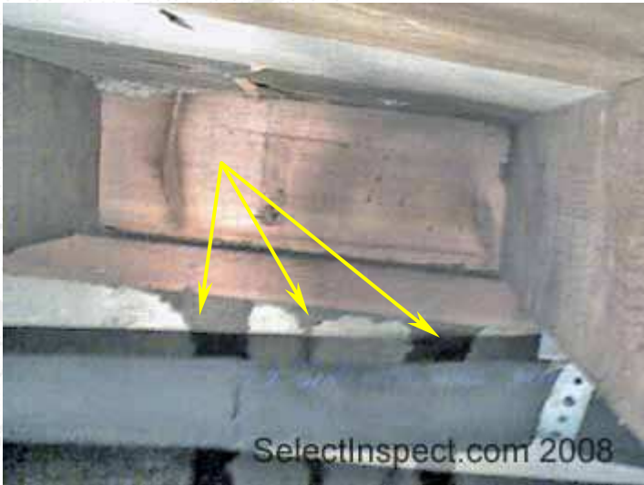
↑ large subterranean termite shelter tubes inaccessible at west crawl space; suspect active subterranean termites inside