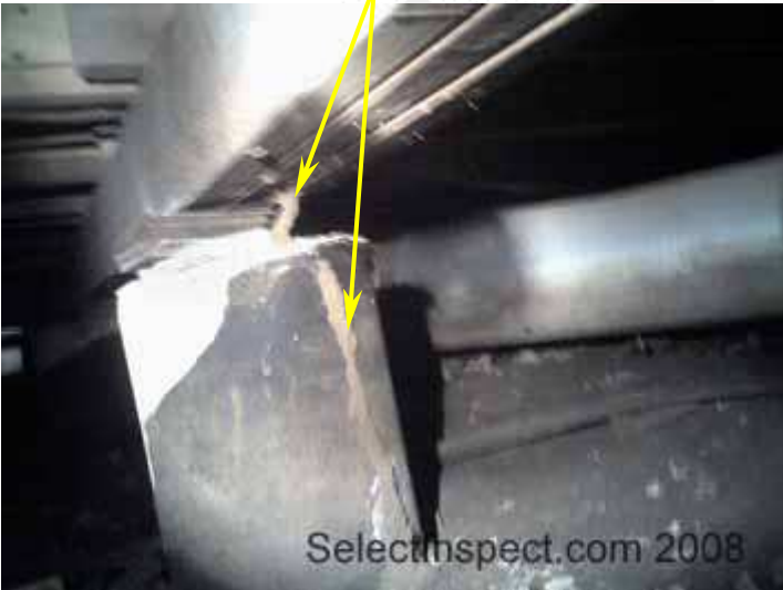
↑ active subterranean termites at crawl space- pier