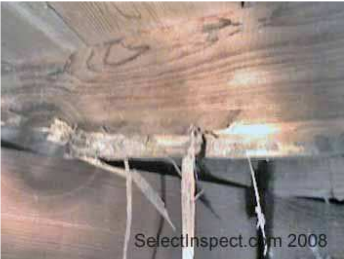
↑ wood destroying insect damage at sub floor