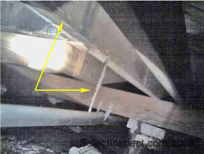
↑ subterranean termite shelter tubes and damage at crawl space framing