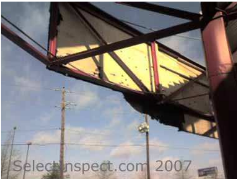
↑ deficient wood and stucco at sign structure- rear view