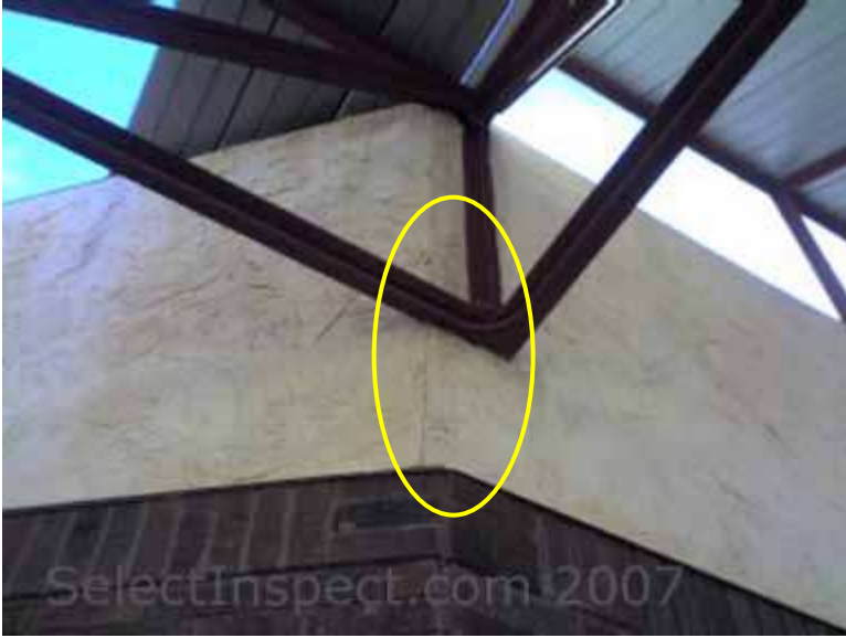
↑ moisture intrusion evidence and cracking at stucco- example