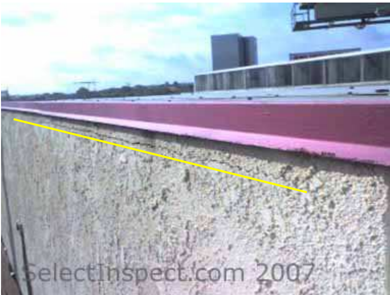
↑ horizontal cracking at east / rear area of bldg below roof parapet