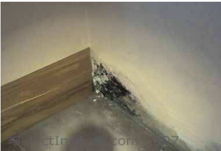
↑ moisture intrusion / fungus at north lower wall- main room