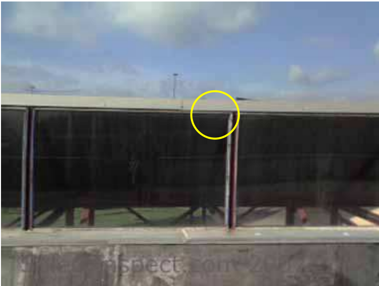
↑ cracked window location