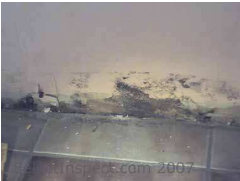
↑ moisture intrusion / fungus at west lower wall- main room