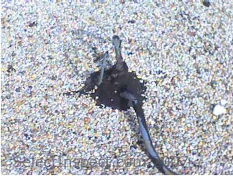
↑ rooftop air-conditioner condenser removed- refrigerant and electrical components remain