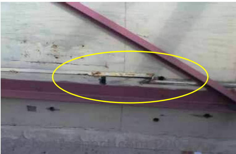
↑ amiss / deficient electrical at north behind sign structure