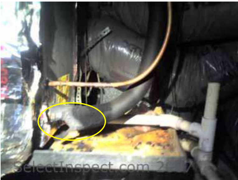
↑ rodent damaged refrigerant insulation and auxiliary pan corrosion at south HVAC / evaporator