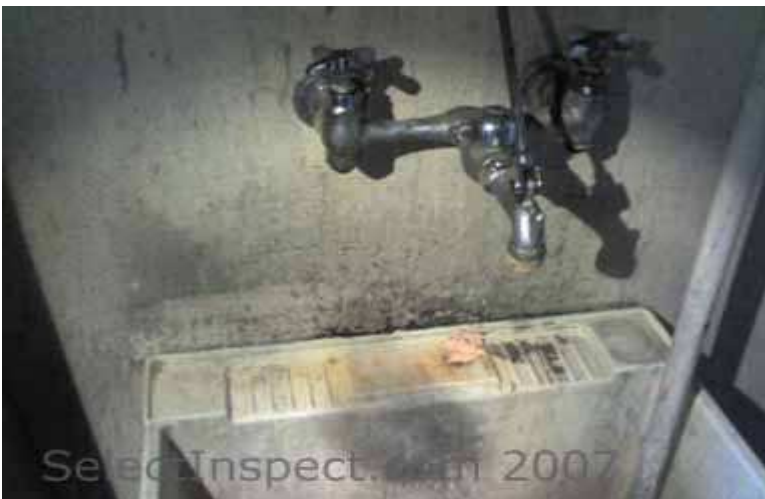
↑ moisture intrusion / fungus and damage at mop room wall