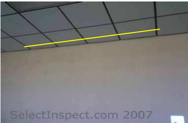
↑ moisture intrusion at main room- east – below ducting