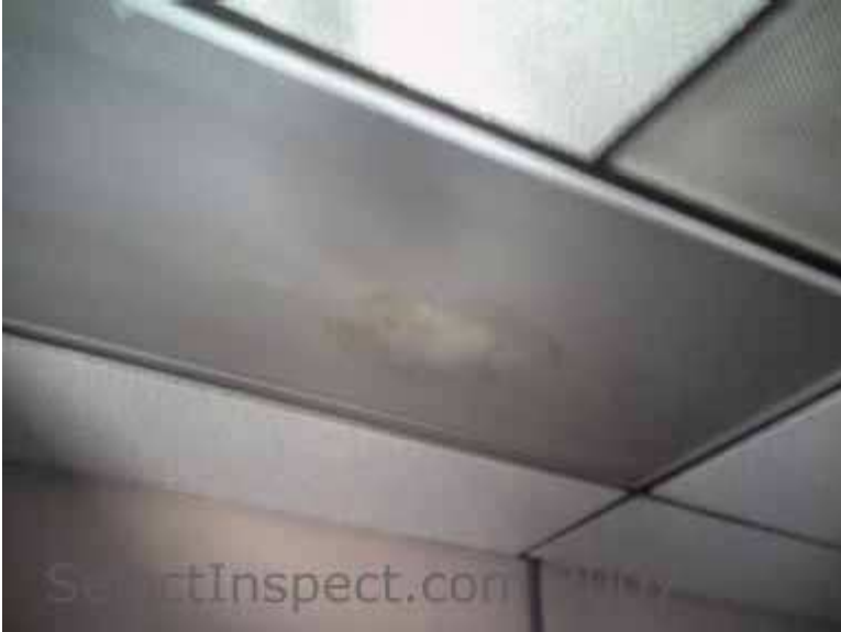
↑ moisture intrusion at light fixture in bathroom