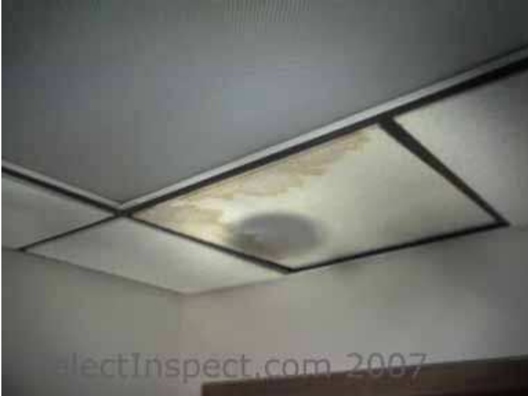
↑ moisture intrusion / fungus at secondary room