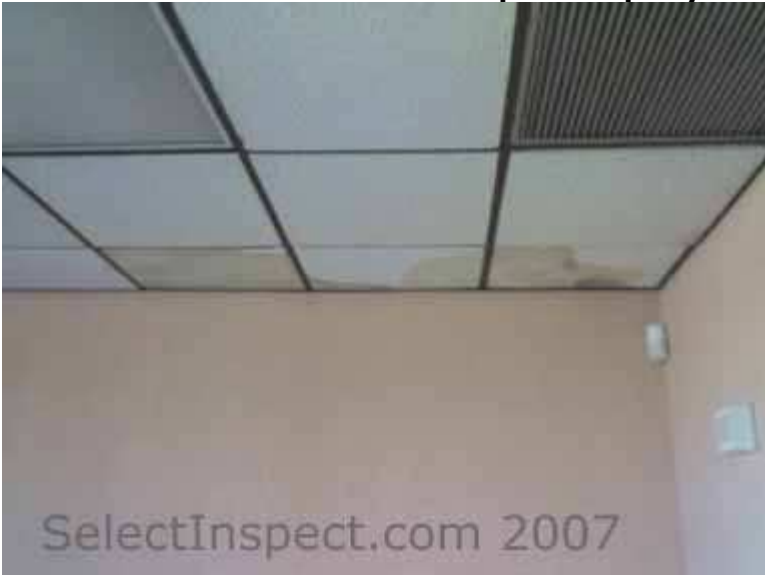
↑ moisture intrusion at main room- northeast