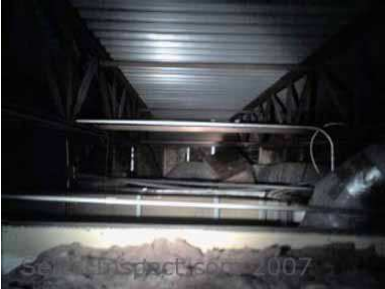
↑ general view of ceiling crawl space