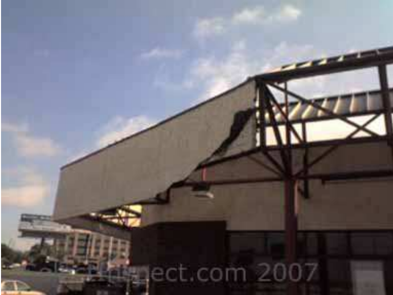
↑ deficient wood and stucco at sign structure- front view