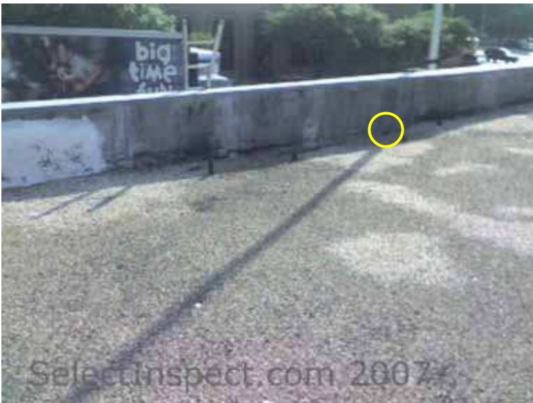
↑ poor drainage at roof- scupper location not at lowest point