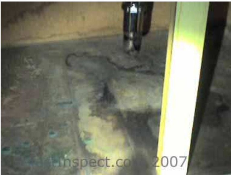
↑ moisture intrusion / fungus under breakroom sink