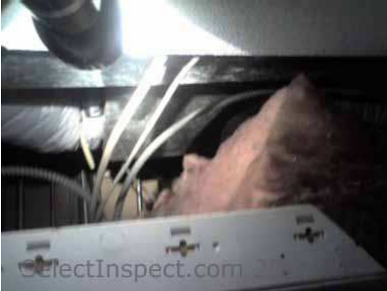
↑ underside of north HVAC in ceiling crawl space- above light fixture (related: image #3 page 8)