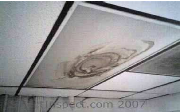
↑ moisture intrusion at light fixture in northeast room- below HVAC (related: image #1 page 12)