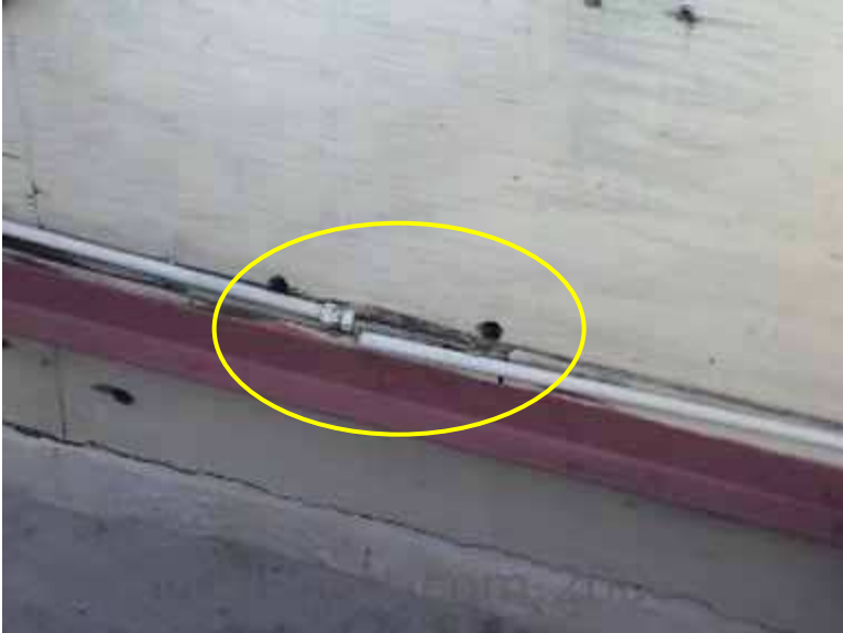
↑ amiss / deficient electrical at northwest behind sign structure