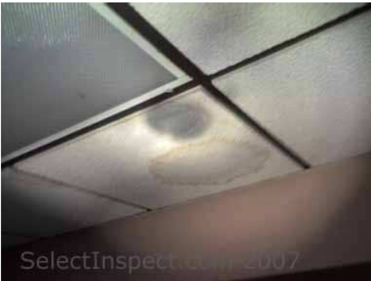
↑ moisture intrusion / fungus at secondary room