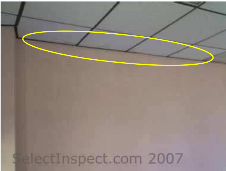
↑ moisture intrusion at main room- north