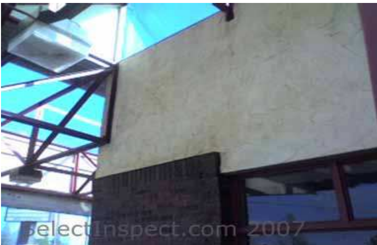
↑ moisture intrusion evidence behind stucco- example