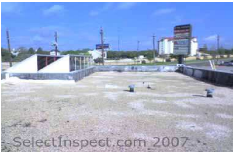
↑ general view of roof over inspected unit- facing northwest