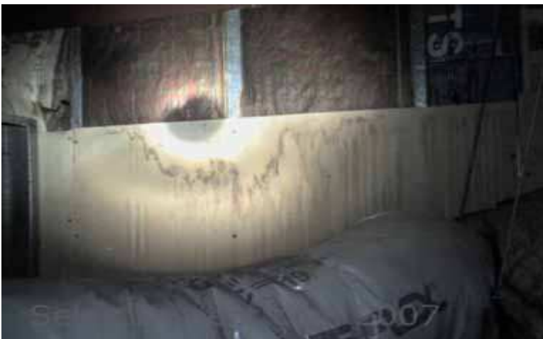
↑ moisture intrusion / fungus at east-southeast perimeter in ceiling crawl space